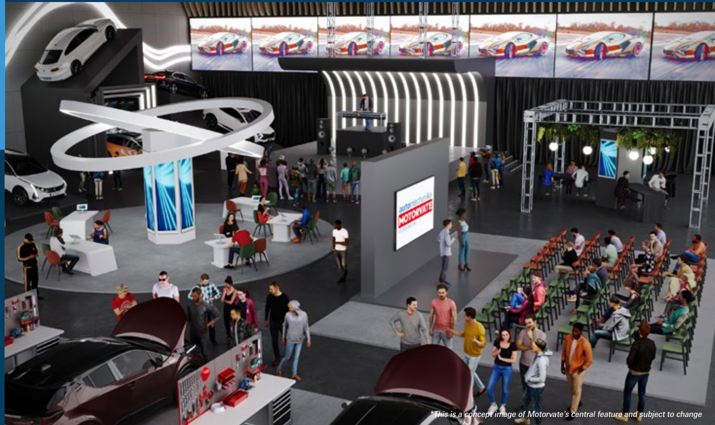
*This is a concept image of Motorvate's central feature and subject to change

Here's how you can be part of the solution.